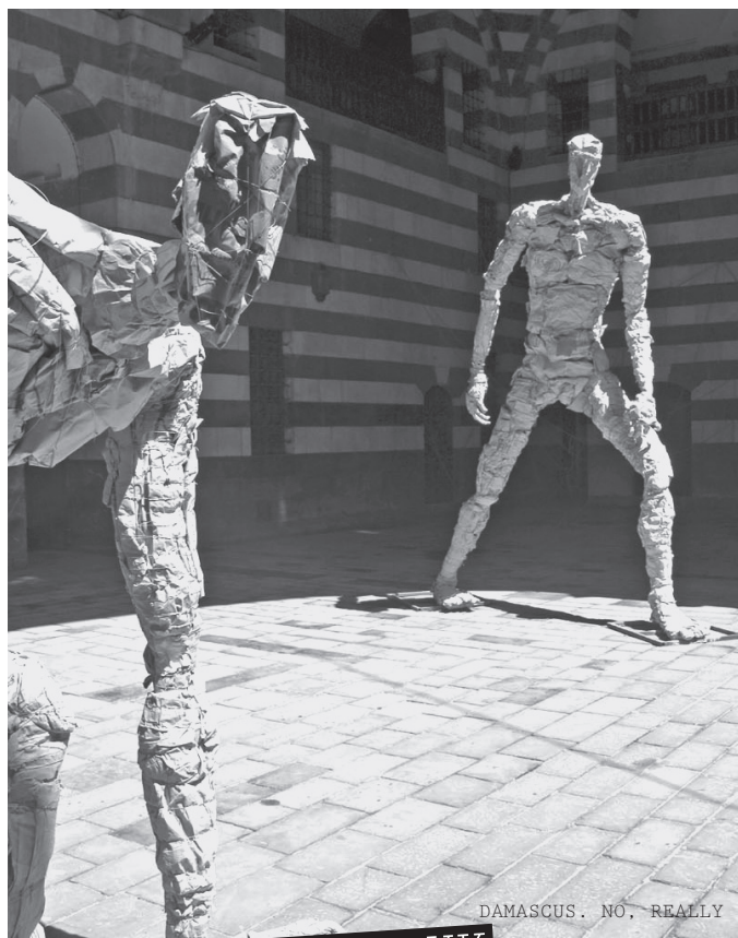
DAMASCUS. NO. REALLY

It's also a city which pampers visitors at a reasonable price. At Beit Al-Mamlouka, which you could call a boutique hotel if a sleepy courtyard with a tinkling fountain and overhanging lemon trees can qualify as a boutique, you have echoing silence just yards from the busy sidestreets, hammams and bars of the Christian quarter. Very Damascus.