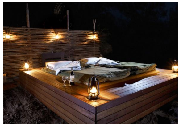
A luxury swag deck

To get under the skin of Australia email info@blacktomato.co.uk or call 02074269888