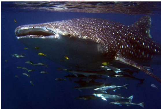
Swim with Whale Sharks