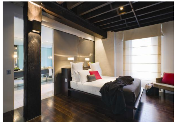
The Establishment, Sydney