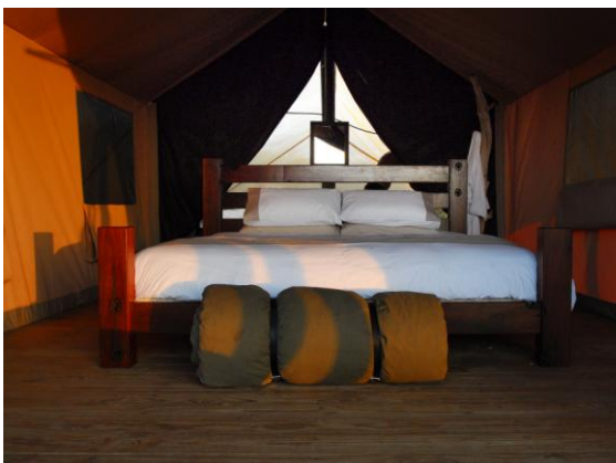
Sal Salis tents